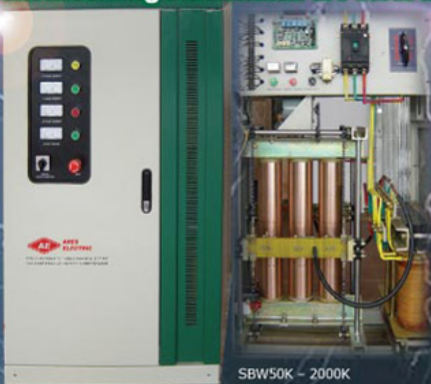
SBW50K - 2000K

Protect & Isolate Your Machine Equipment from Incoming Fluctuation & Power Disturbances