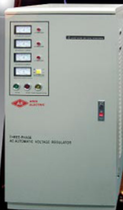
TNS3K - 40K

Protect & Isolate Your Machine Equipment from Incoming Fluctuation & Power Disturbances